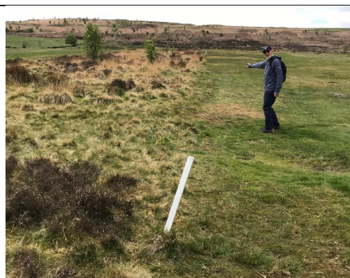
2. Follow series of short white posts alongside the fairway