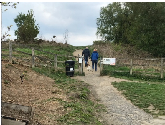
1. Gate on to the Moor by Baildon Golf Club

Cross Hall Cliffe towards the Angel pub (following the finger post to THE MOOR and Toilets). Cross Northgate on the pedestrian crossing and continue up the Lefthand side of the road, passing the public toilets. Cross the junction with Pennithorne Avenue, and just before the cattle grid, take the diagonal track to the Left through a rough car park, passing round the front of the Golf Club building (the Old Waterworks) and through the gate ( photo 1 ) onto the moorland at the edge of the Golf Course. Take the track bearing Right and continue over a cross-track. Where the track you are on bears Right, leave it to go ahead on grass at the edge of the fairway and adjacent to rough ground and a gully, towards a tall white post, ( with the wall-corner of the former reservoirs beyond ). Squiggle to the Left to cross on a path over a gully, and then immediately Right to walk again between a fairway to your Right and rough ground to your Left, following a series of short white posts ( photo 2 ).