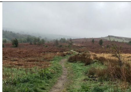
Start of the path across towards Sconce.