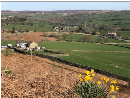
View from above the White House

Continue ahead. When you see the White House to your Right, take the path that descends to the access road to the White House and walk along it to the junction with Hawksworth Road. Cross this busy road with care and take the broad and clear path which heads across the bottom of the Golf Course towards Sconce.