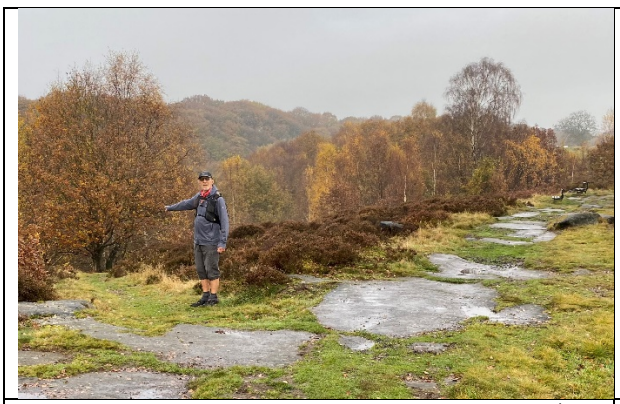
From Bracken Hall Green take descending path just before two seats

Head up (North) along Bracken Hall Green, passing to the Right of two trees and a line of four seats and gradually working your way over the Left of the Green. Continue ahead, keeping fairly close to the edge of the escarpment and woods below, passing another four seats close together. A little further on, just before two seats together (opposite a wide metal gate in the wall on the far side of Glen Road), turn Left on a grassy path and almost immediately Left again to descend almost back on yourself, on a rough but gently descending path down into Shipley Glen through woodland.