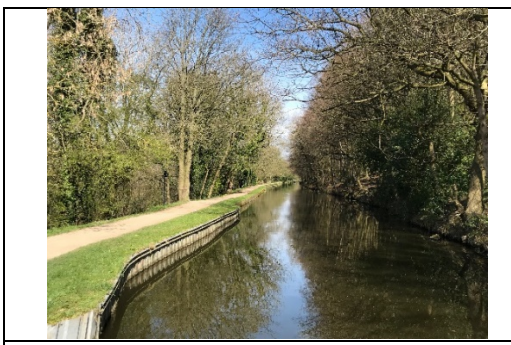
The canal towpath

** {Option to go straight ahead out of the car park and cross the road to visit the Hirst Wood Nature Reserve, before returning to the route. The Nature Reserve was created and is looked after by local residents. A short distance up the road to the Right you will find the Higher Ground Café when it is able to be open}.