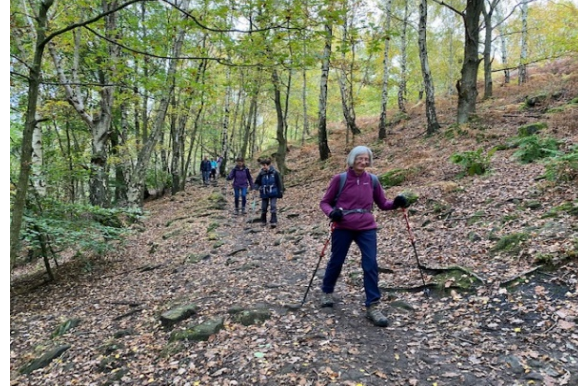
Descending path into Shipley Glen

Near the bottom, bear slightly Right to descend to iron railings around a former millpond. Turn Left and descend three steps (Lode Pit Beck is to your Right). Take clear path Left, rising above and away from the stream. Soon, look out for and pass through a metal gate on your Right and cross a stile. Take the descending path across open ground, veering initially Left around woodland edge, and crossing 2 streambeds on wooden planks, before veering Right and descending with woods and the Beck on your Right, to emerge through a gate on to Coach Road (a rough track at this point). Turn Right over Lode Pit Beck and very soon pass Left beside a wide gate signed "Private Road. Bradford Amateur Rowing Club", to follow a track towards the River Aire. Approaching the Weir, which formerly provided power to the Hirst Mill, turn Right to pass in front of the Rowing Clubhouse.