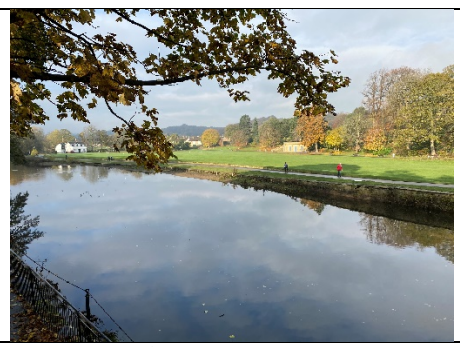
Entering Roberts Park

Turn Right and follow the canal towpath towards Saltaire. As you approach a road bridge over the canal and mill buildings ahead of you, turn Left to the pedestrian bridge over the River Aire into Roberts Park. (Option to spend some time in the Park). Continue ahead. Do not exit through wide gateposts to your Right by the adventure playground, but instead take the rising path ahead, following it around the outer edge of the Park to reach a pedestrian exit gate on your Right and emerge on to Coach Road. Cross at the pedestrian crossing and turn Right for a short distance. Bear Left to cross the school car park, diagonally, to a metal exit gateway, and descend steps to go Left on a tarmac path towards the lower station of Shipley Glen Tramway (wall and fence on Left and grassy field on Right). Follow the track that rises alongside the tramway track. Passing the top station, continue ahead on the pavement of Prod Lane to pass the Glen Pub and Tearoom and return to Bracken Hall.