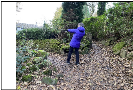
Pt. D: Take the Left fork at the path-divide

Continue along this generally level track with housing to your Right and Walker Wood, descending below you on the Left for about half a mile to where the path divides (Pt. D). Take the Left fork and arrive by the Shipley Glen Tramway top station. Turn Left down the track alongside the Tramway track. After passing the lower station, bear Left diagonally across a field heading for the Lefthand edge of a children's play area. Exit on to Thompson Lane. Turn Left, Passing Glenaire Primary School, and cross to the other side of the road when it is safe to do so. When you arrive at a road T-junction, go Right, passing a triangle of open grass to your Right. Soon cross the road to pick up a track in front of houses on the Left at 90 degrees to the road. Continue on this track as it becomes a path and heads up, over the open common land of Baildon Green, bearing slightly Left as you rise, towards a large bramble patch. After skirting around the Right of the brambles, bear Left and almost immediately Right on paths heading for the top Left-hand corner of the open area.