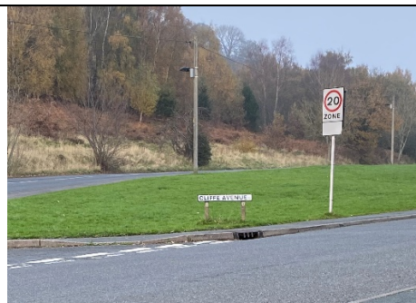
Junction of Green Lane and Cliffe Avenue

Cross Bertram Drive, heading slightly Left to join another clear path, heading up across the next open area of Baildon Green. This path stays parallel to Green Lane on your Left. After passing through some scrub, arrive at Cliffe Lane West. Turn Left and cross to ascend some steps to the junction of Green Lane and Cliffe Avenue. Cross and skirt behind the Cliffe Avenue sign to go ahead along the grass, behind bungalows and past a stand of beech trees above the Cliffe Avenue play area. At the end, veer Left to join the pavement on Green Lane behind Baildon Community Link. Cross the road and take the rising track up the Bank to emerge once again at Pt A. Continue ahead along Bank Walk to rejoin Westgate and follow the road down to the centre of Baildon and the Potted Meat Stick.