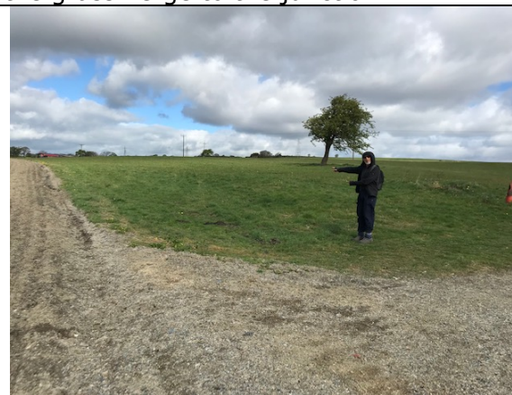
2. Turn Left after crossing the second gallop

Cross Bingley Road with care and, almost straight away, take the first signed footpath leaving the road to your Right. Continue ahead and pass through a gate. Cross the horse gallop, going ahead, on a grassy path to the Left of a gallop. Very soon, cross another gallop and turn Left by an isolated hawthorn tree ( photo 2 ). Walk on the grass adjacent to the gallop. As the gallop bends to the Right, cross it and continue ahead (by another