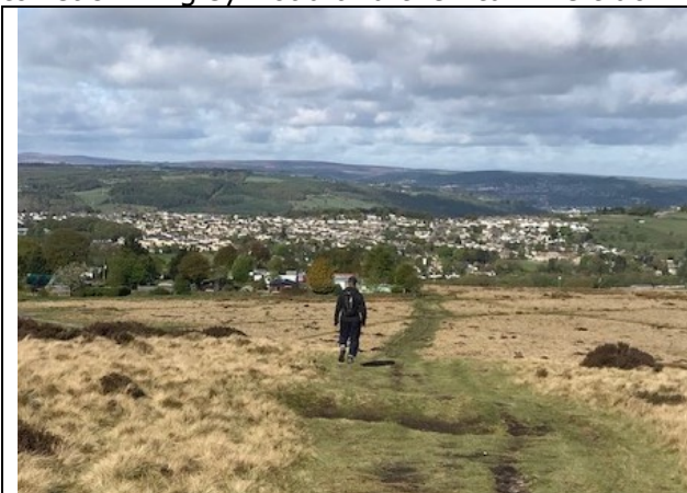
1. Descending towards Dobrudden

Walk up Northgate (following finger post to THE MOOR). Just before the cattle grid, leave the road, taking the diagonal track to the Left, passing round the front of the Golf Club building and through a gate onto the moorland at the edge of the Golf Course. Take the track bearing Left and continue straight up to the trig point on the top of Baildon Moor. Having admired the 360 degree view, continue in the same direction as you descend towards the right hand corner of Dobrudden Farm Caravan Park ( photo 1 ). At the corner, Turn Right, taking a clear grassy, and initially level path. You are aiming to get to the road junction at the top of Shipley Glen, where Glen Road intersects with Bingley Road. As this junction starts to come into view below to your Left, either take a (quite steep) descending path to the Left, or, if you prefer, stay on the good path you are on, to reach Bingley Road and then turn Left down the grass verge to the junction.